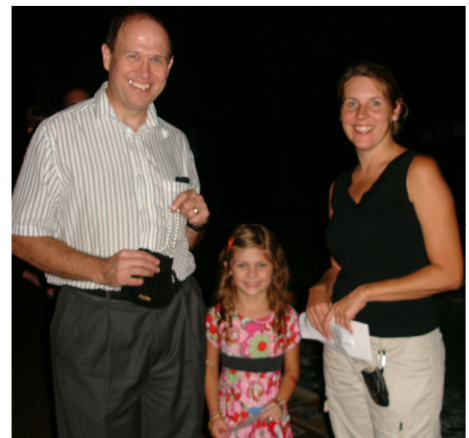
Big grins from the winners!